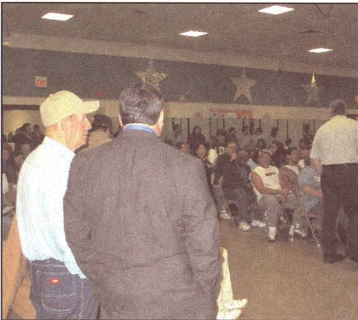
Concerned Citizens of Mullica held a meeting to inform residents about the transfer station.