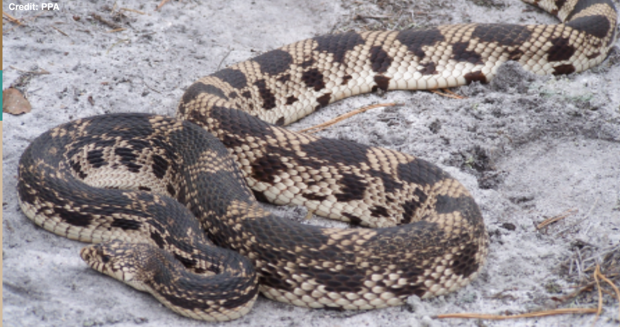
Northern Pine Snake, the threatened species that has been found on the property proposed for a WalMart development in Toms River